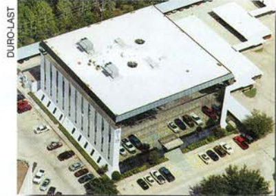
A light-colored vinyl roof can reduce a building's cooling costs.

its impact on cooling costs, Lincoln says. The roof is white and reflects heat from the sun. In contrast, the old black roof retained heat. In fact, a thermometer placed on the black roof during installation of the new membrane showed a temperature of 100 to 125 degrees F. The temperature on the vinyl roof at the same time was about 75 degrees F, the same as the ambient temperature. "It takes less energy to keep the casino cool," Lincoln says.