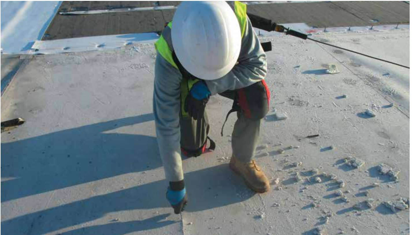
Figure 2. Roofing contractor removing PVC roof membrane and prepping for recycling.