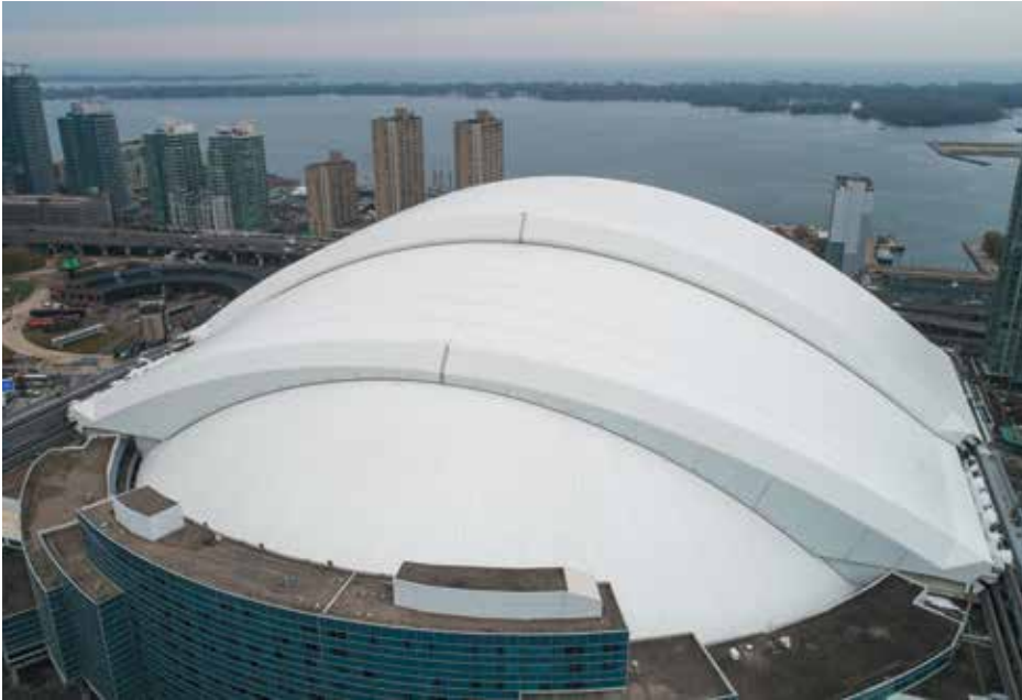
Figure 4. The Rogers Centre in Toronto, Canada.