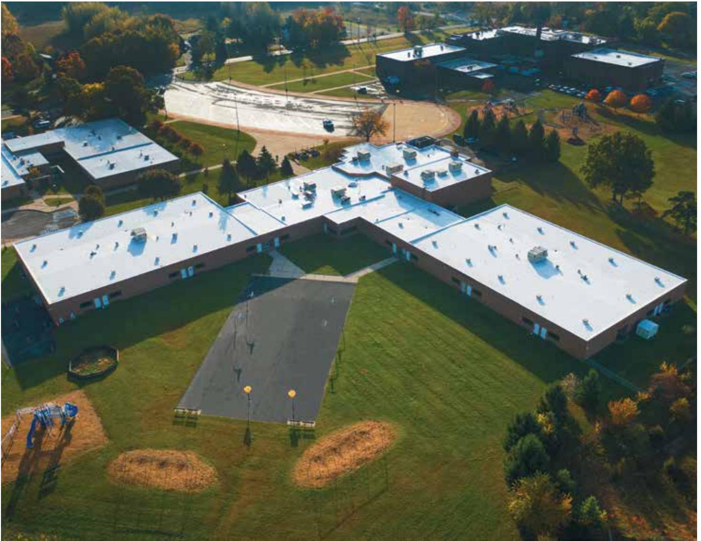
Figure 6. Overhead view of the PVC membrane reroof project at Bishop Elementary School in Ypsilanti, Michigan.