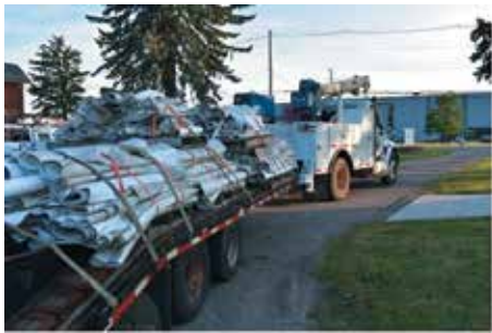
Figure 7. PVC roofing membrane from roof tear-off transported from job site to recycling facility.