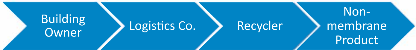
Figure 5. Open-loop recycling. The PVC membrane manufacturer specifies recycling with the owner. The recycler then sells to the open market.

A PVC roof recycling project candidate can be a roof of any age or size, but certain parameters increase the attractiveness of the material for recycling. Generally, roofs larger than 800 squares (80,000 ft 2 [7,400 m 2 ]), are excellent candidates for recycling since the quantity allows for a full truckload of material, and roofs less than 20 years old have the benefit of modernized PVC formulations which